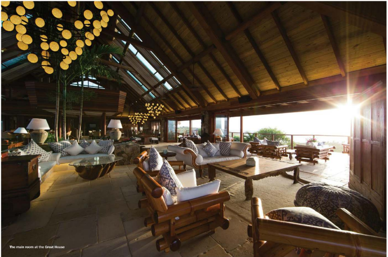
The main room at the Great House