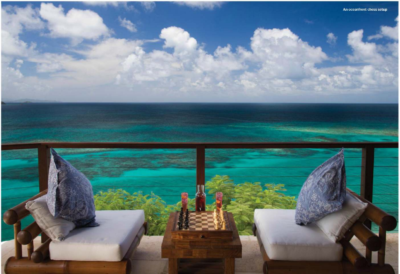
An oceanfront chess setup